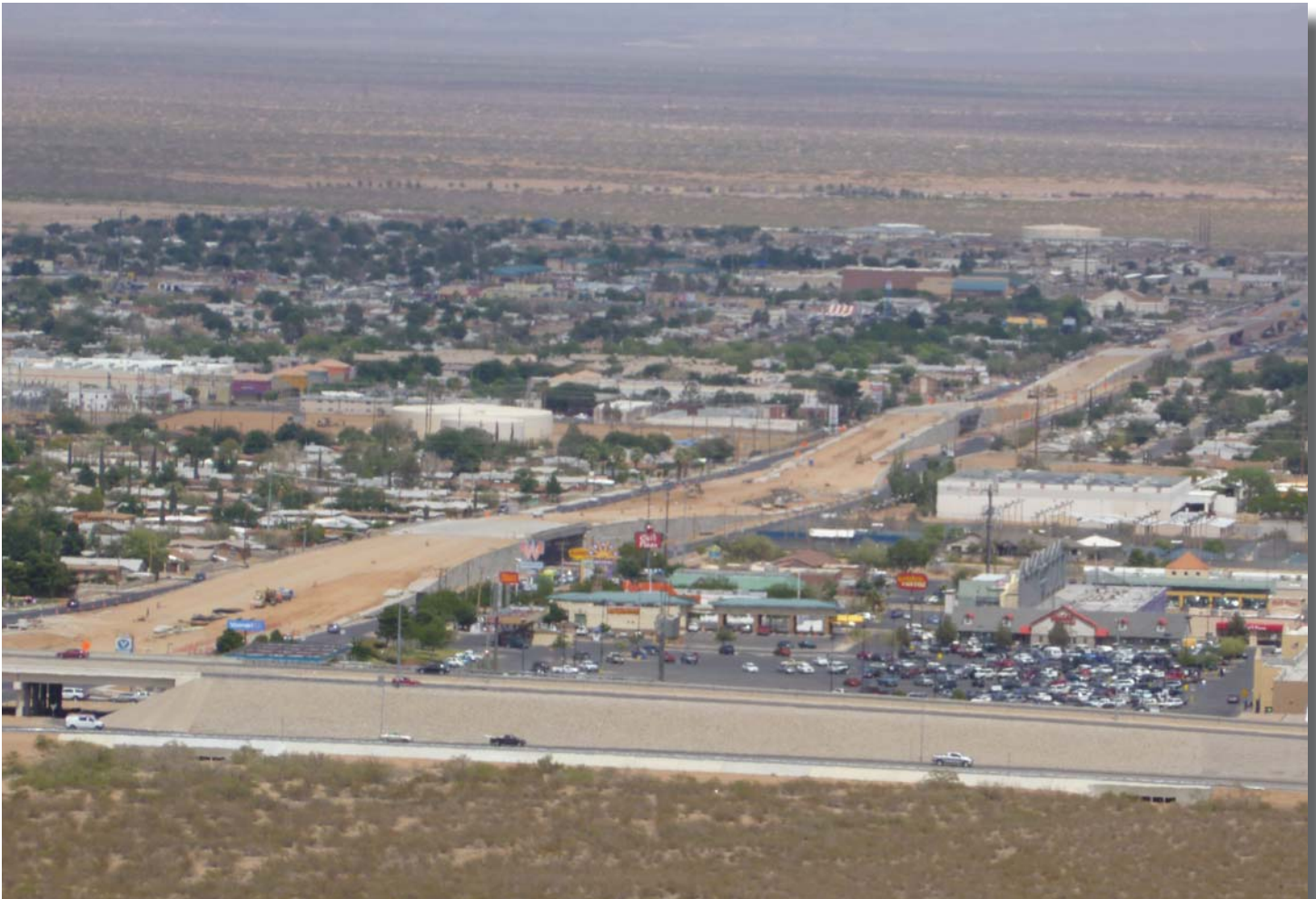
Above: Loop 375 (Woodrow Bean) Mainlanes Expansion project limits as seen from Transmountain Rest Area. The first overpass from the perpendicular running highway (US-54) is Kenworthy, followed by Rushing and in the distance is the Alcan overpass.