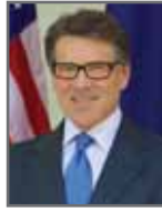
The Honorable Rick Perry Governor of the State of Texas

Tuesday, September 16, 2014 8:30am – 8:45am