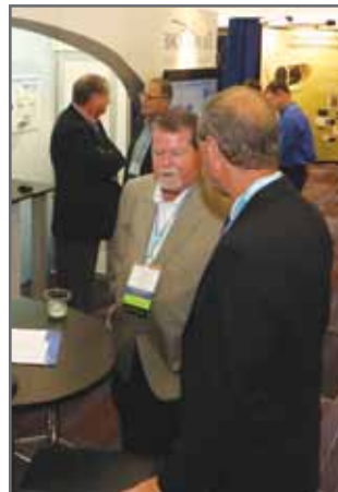
EXHIBIT SET UP