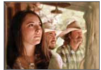
Tessy Lou & The Shotgun Stars