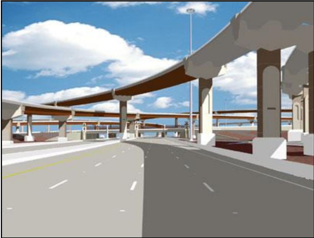
Figure 3. Ultimate Design Conceptual Sketch