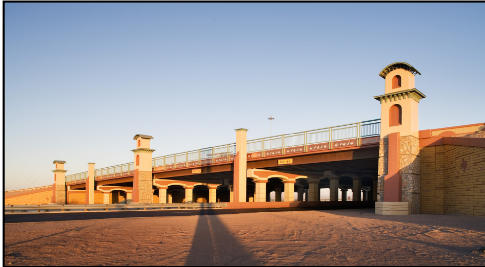
Figure 1. Existing Interchange

The I-10/Loop 375 (Americas) Interchange is proposed a four level, fully directional interchange, in its ultimate design, and will be built in phases. The first phase was the extension of the Loop 375 mainlanes from North Loop Road to Bob Hope and opened to the public in 2005.