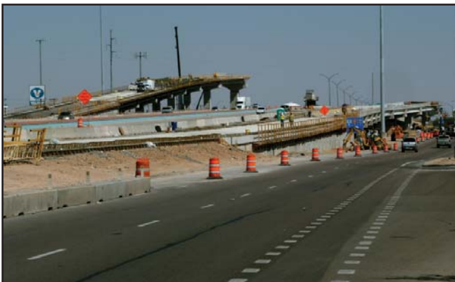
Below: Looking north at the two direct connectors. A steel girder section will tie the Joe Battle portion to the Zaragoza portion of the bridges.