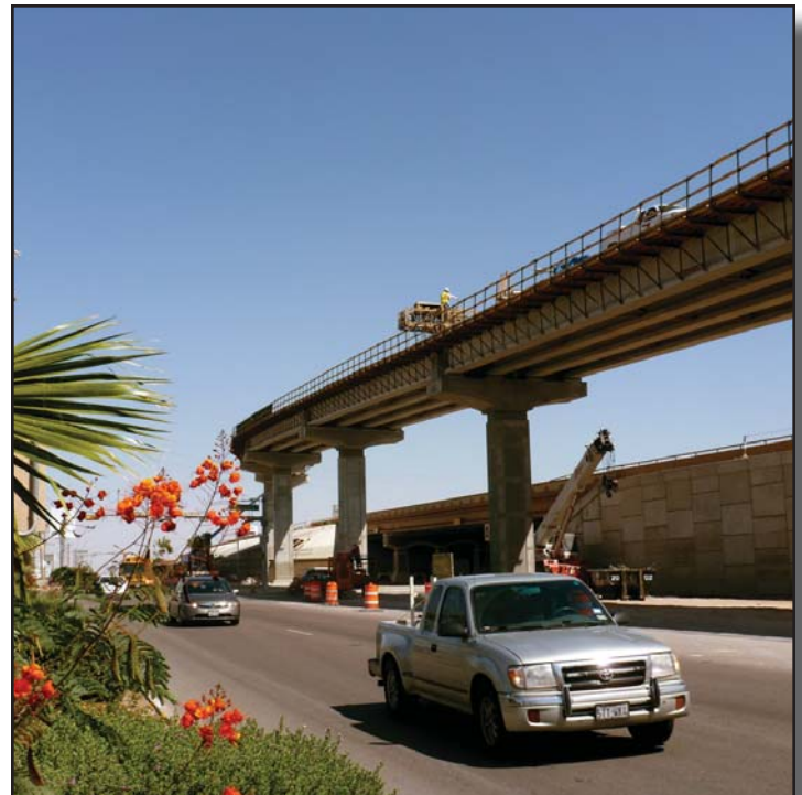
Above: Southbound direct connector along southbound Joe Battle.