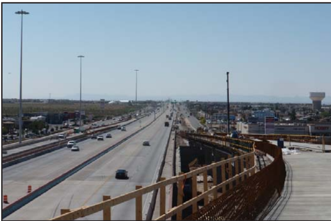
Above: Southbound direct connector as it ties into Joe Battle southbound mainlanes.

The new phasing for the traffic signals at Sunfire and Zaragoza has proven to be successful; as motorists have adjusted to the new work zone and associated traffic configuration.