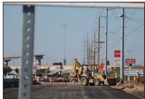
Right: Preparing new roadway along southbound Zaragoza.