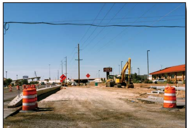
Above: Removing existing asphalt on southbound Zaragoza. The contractor is also installing new drainage lines in the right-of-way.

TxDOT is still finalizing the change order for the revised traffic control plan and associated costs. It is anticipated that the change order will be made available for CRRMA review during October.