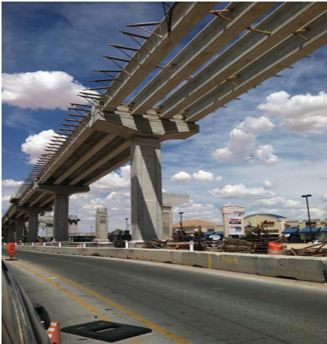
Above: Construction of the southbound direct connector. The outer beam's overhang is being built for temporary access for placement of precast deck panels and barrier railing.

Following the acceptance of each concrete deck pour, the contractor slip formed the barrier rail to give the bridge a more complete look. This process of deck pour/ barrier rail pour will continue through October as the contractor works to complete the bridge construction by November.