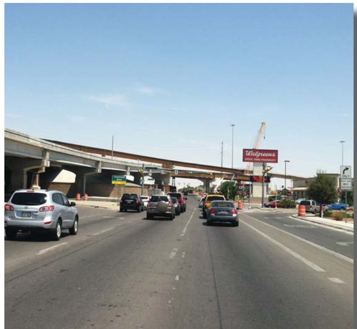
Above: Direct Connector bridges from northbound Joe Battle frontage road at the Montwood intersection.