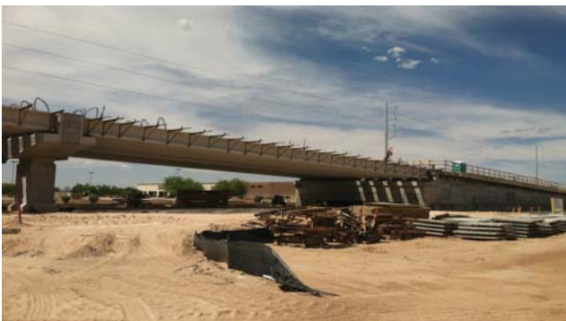
Below: Zaragoza bridge abutment and Span 1, between the abutment and NB Bent 2.