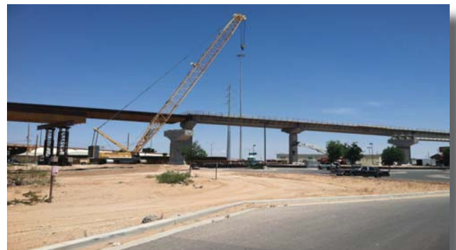
Above: Steel girder erection for the northbound direct connector.

In spite of numerous delays, it is exciting that TxDOT proceeded with an accelerated schedule. This corridor has been in desperate need of a traffic solution; and, it is the mission of the CRRMA to assist in providing mobility solutions for the greater El Paso community.