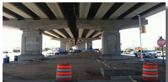
Below: Just west of the Zaragoza bridge abutment looking west at the underside of the bridge deck.